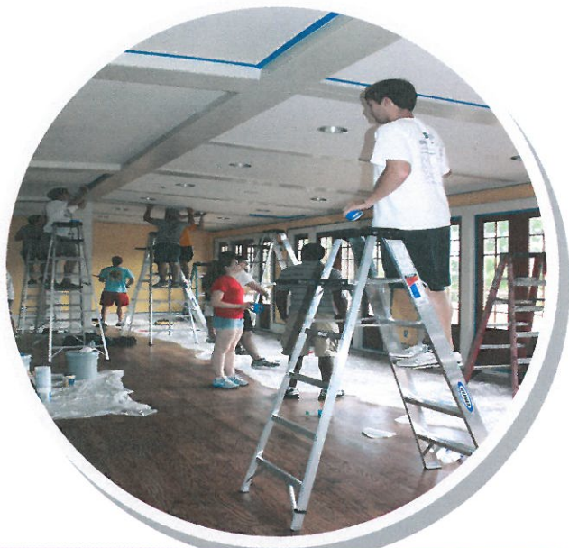
Volunteers keep giving! LSU Medical students recently painted the Parkview Terrace.

7500 people came to the Park's Inaugural Happy July 3rd Celebration. There was music by the Marine Corps and the New Orleans Navy Brass Band, fireworks, and fun for all.